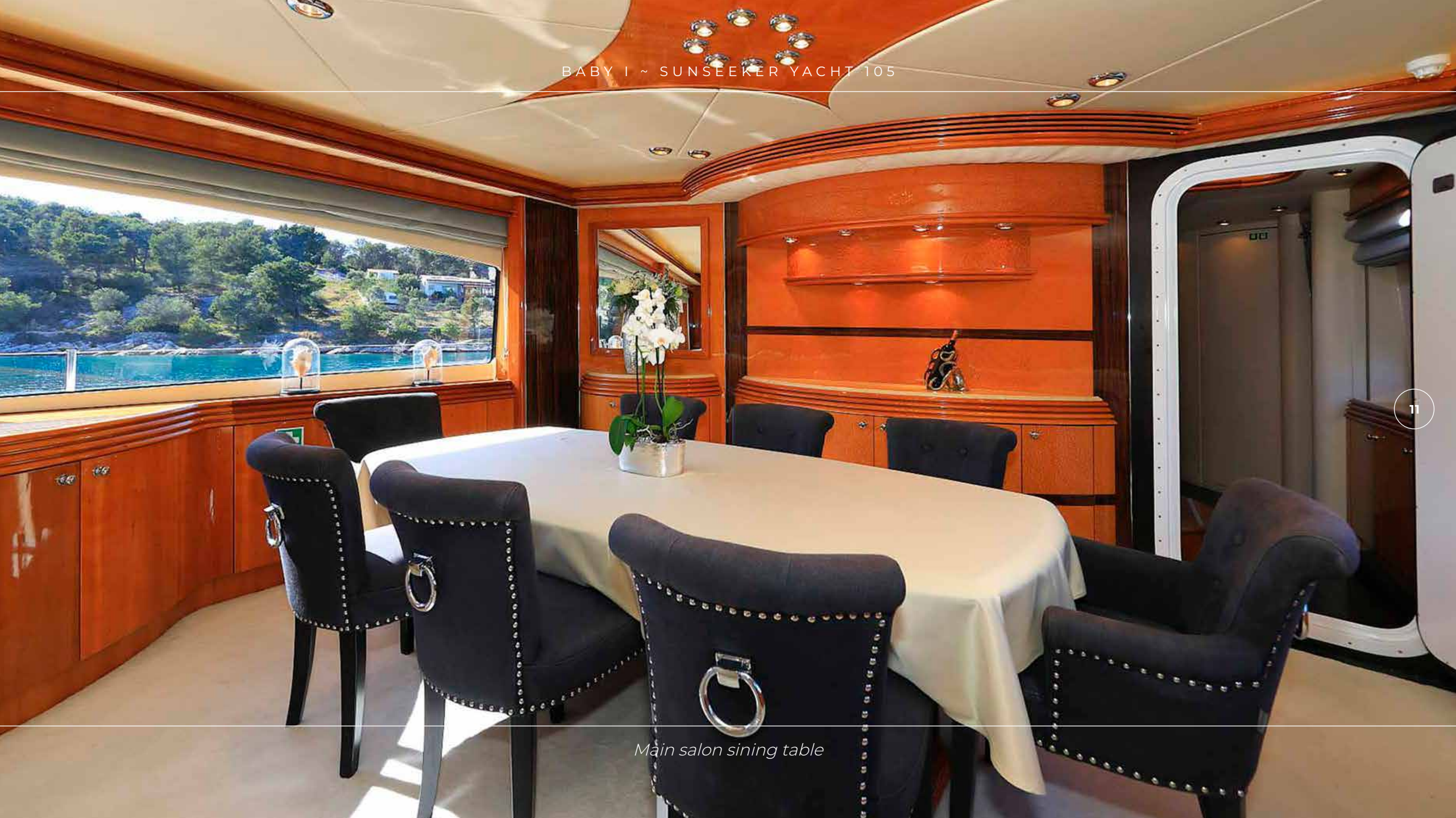
Main salon dining table