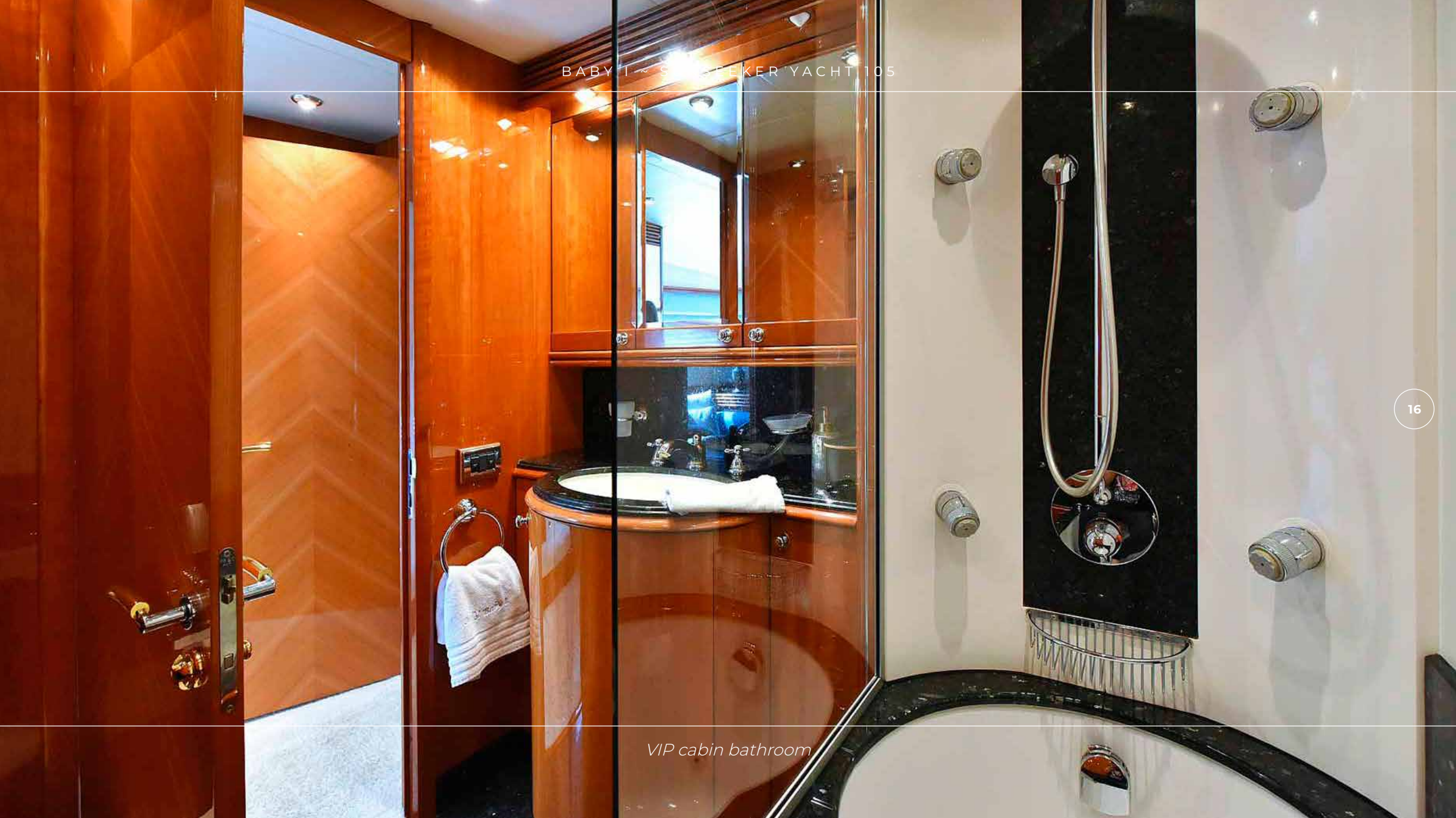
VIP cabin bathroom