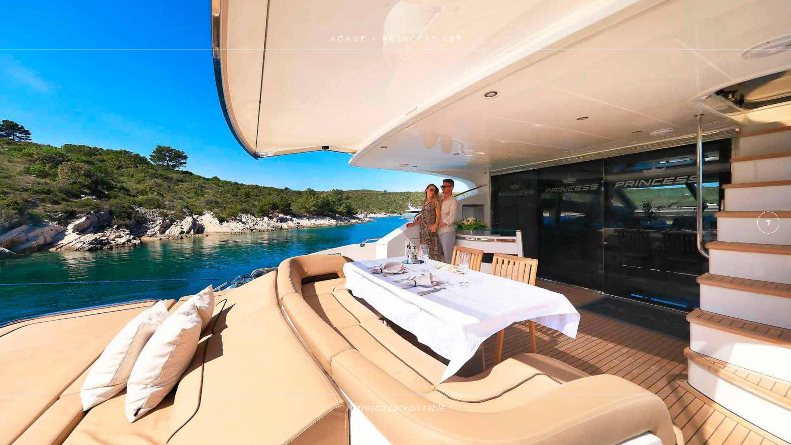
A fresco cockpit table